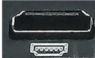
Figure 916: Figure 5: HDMI Connector

Although not equipped with the screen on its own, the CS86-BOX-J1900 features 1 x HDMI connector ( Figure 5 ) and 1 x VGA connector ( Figure 5a ). The two connectors allow connecting two external monitors in synchronous or asynchronous modes. HDMI and VGA output resolution can be configured by the software or the OS, up to 1920 x 1080 at 60Hz.