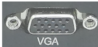
Figure 917: Figure 5a: VGA Connector