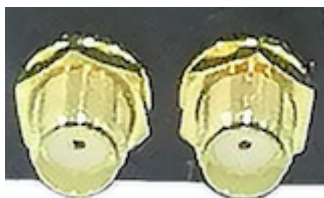
Figure 919: Figure 7 SMA Connectors for WiFi Antennas

The product includes two SMA connectors for external Wi-Fi antennas, as illustrated in the Figure 7 below.