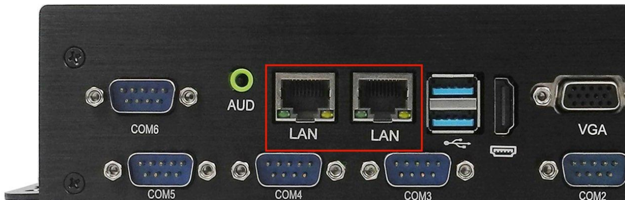
2 x RJ45 GbE LAN Connectors

2 x LAN (RJ45) connectors provide Ethernet connectivity over standardized Ethernet cables. The integrated two-port Ethernet interface supports 10/100/1000BASE-T/TX specifications with automatic speed negotiation and Wake on LAN (WoL) functionality. Power over Ethernet (PoE) is not supported.