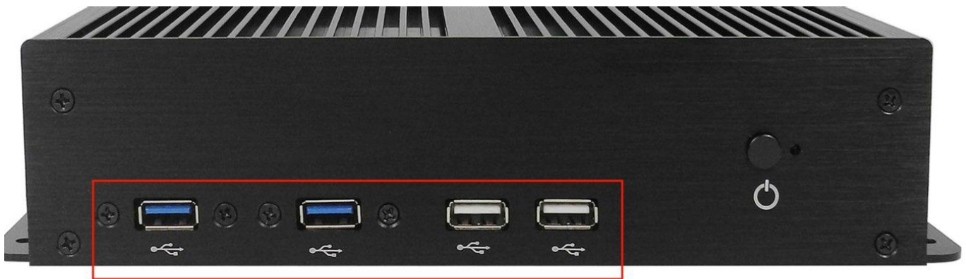
USB 3.0(Left 2) and USB 2.0(Right 2)