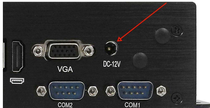
12V DC Power Input

The CS86-BOX-5005U Industrial Box PC should be powered by 12V DC, the connector is 5.5 x 2.5mm DC input.