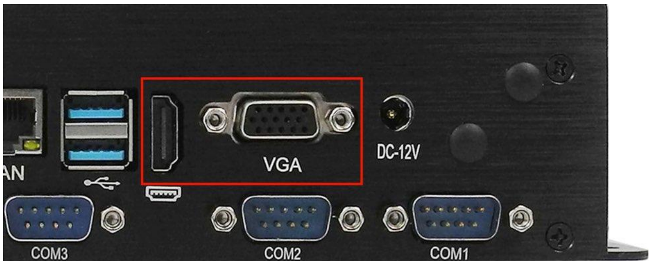
HDMI(Left) and VGA(Right) Ports

The HDMI out port, supports video output up to 2560x1600 60Hz; the VGA out port, supports up to 1920x1080 60Hz. These two video output ports support independent/ identical display, which means you can display same video or different video on two external screens.