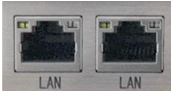
Figure 926: Figure 4: 2 x RJ45 GbE LAN Connectors

2 x LAN (RJ45) connectors ( Figure 4 ) provide Ethernet connectivity over standardized Ethernet cables. The integrated two-port Ethernet interface supports 10/100/1000BASE-T/TX specifications with automatic speed negotiation and Wake on LAN (WoL) functionality. Power over Ethernet (PoE) is not supported.