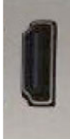
Figure 927: Figure 5: HDMI Connector

The PPC-10510U-150-C Industrial Panel PC is equipped with 1 x HDMI connector. The HDMI connector ( Figure 5 ) allows connecting an additional (external) monitor. HDMI output resolution can be configured by the software.