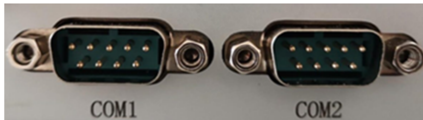
Figure 923: Figure 2: 2 x D-sub Connectors: RS232 or RS485

Product has 4 x 9-pin D-sub connectors ( Figure 2 and 2a ) which are configured as RS232 interfaces by default. The two 9-pin D-sub connectors labeled COM1 and COM2 can be configured as either RS232 or RS485 communication interfaces. If different configuration is required, please get in touch with Chipsee technical support at support@chipsee.com