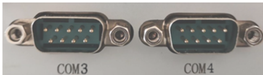
Figure 924: Figure 2a: 2 x D-sub Connectors: RS232